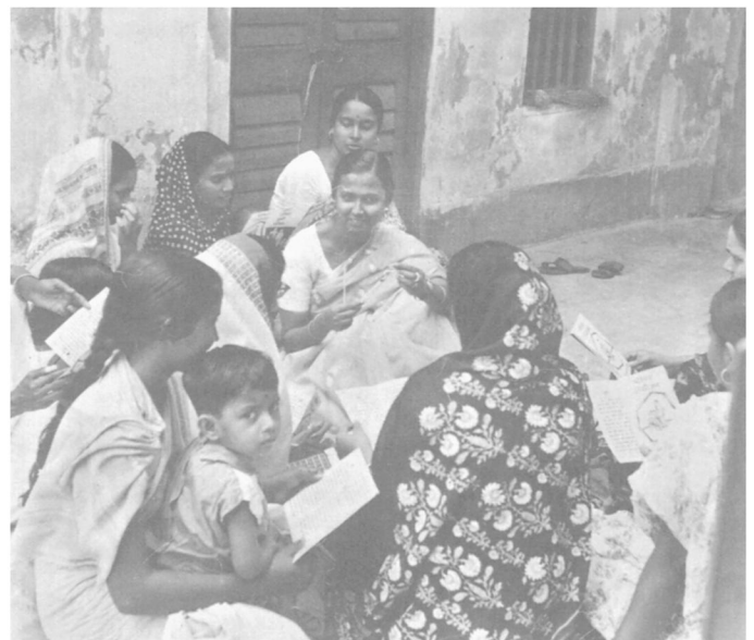
Voluntary fertility control is perceived by many as the ‘ideal’ method of population control.